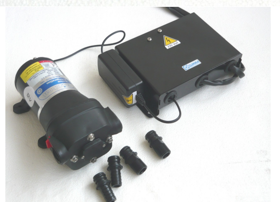
Mains adaptor M82820 + self priming pump A092819C